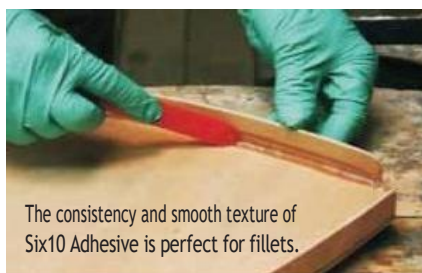
The consistency and smooth texture of Six10 Adhesive is perfect for fillets.

With the 600 Static Mixer attached to the Six10 cartridge, it's easy to lay down a bead of thickened epoxy adhesive right where you need it.